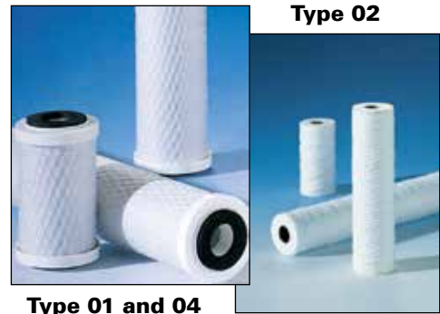
Type 01 and 04

Retention ratings 2 -1: 1 µm -2: 5 µm -3: 10 µm