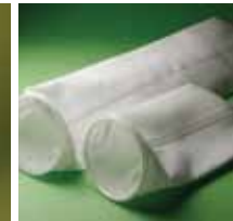
UNIBAG™ Efficiency with an economical advantage

Eaton North America – HQ 70 Wood Avenue, South 2nd Floor Iselin, NJ 08830