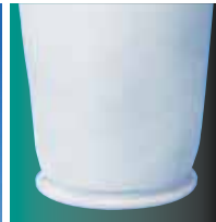
DURAGAF™ Up to 3 times the life of standard bags