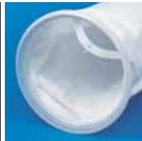
LOFCLEAR™ Oil removal and gels