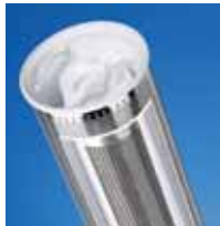
HAYFLOW™ Up to 5 times the life of standard bags