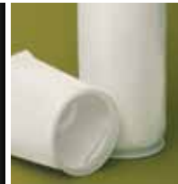
SENTINEL® High quality, durable performance