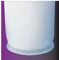
ACCUGAF™ Absolute rated at 99%