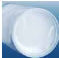
PROGAF™ Absolute rated with up to 15 layers of media